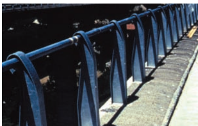
Guard Rail Sidewalk Detail