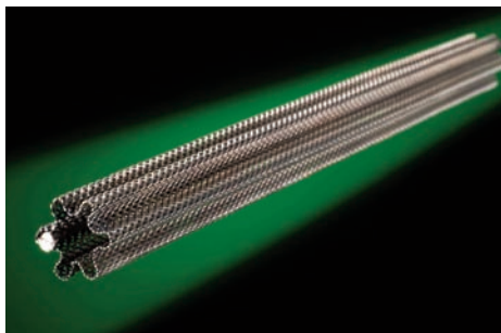
STARGARD™ Discrete Mesh Anodes