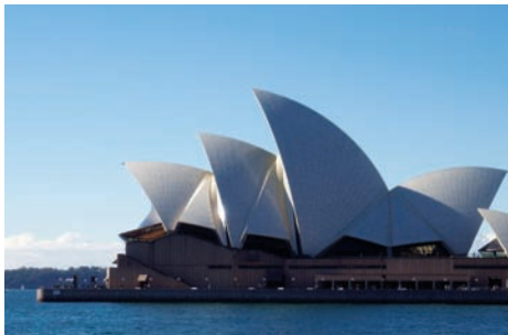
Sydney Opera House

The STARGARD™ Discrete Mesh Anodes compliments our existing ELGARD® and LIDA® anode product line for the Cathodic protection of steel reinforced concrete structures. It is composed of a precious metal oxide catalyst on an expanded titanium mesh substrate.