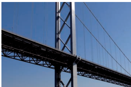
Forth Road Bridge Edinburgh