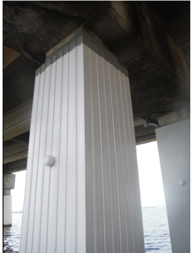
Galvashield Tidal Plus Jacket provides protection to pile sections above the tidal zone.