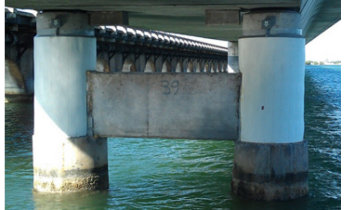
Galvashield DAS Jackets provide protection to pile sections above the tidal zone.