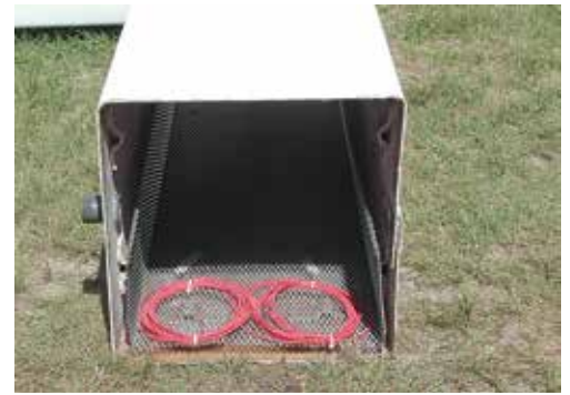
Galvashield Tidal Jacket with Zinc Mesh

Galvashield DAS Jackets incorporate premanufactured alkali-activated distributed anodes that do not require saltwater exposure to function. These jackets can be used in all conditions and all elevations including saltwater, brackish water, freshwater and dry land applications.