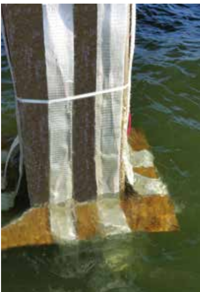
Galvashield Tidal Plus Jacket with Wicking Fabric Anodes (prior to jacking)