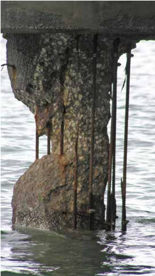
Corrosion of Prestressed Concrete Pile in Saltwater Tidal Zone