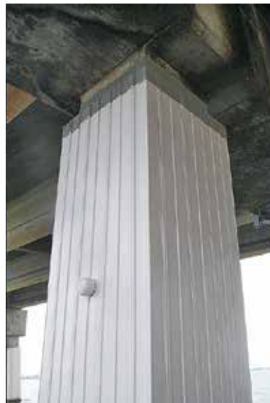
Galvashield Tidal Plus Jacket with Modular PVC Stay-in-Place Formwork