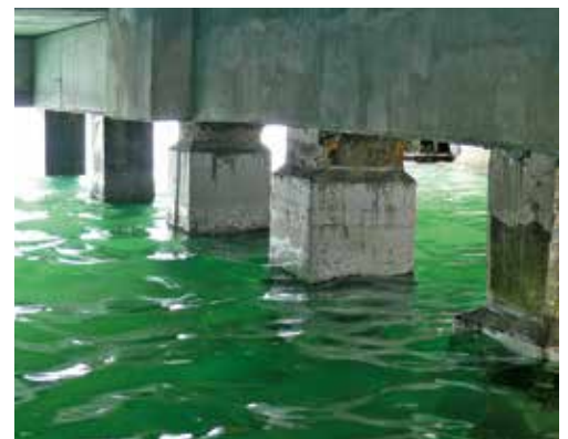
Galvashield Tidal Jackets in Service