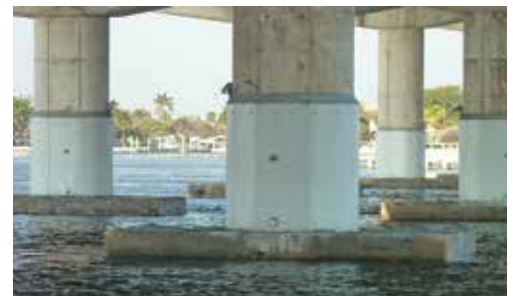
Galvanode DAS Jackets Installed