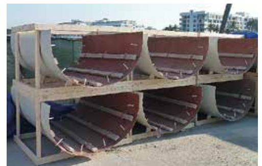
Galvashield DAS Jackets Prior to Installation