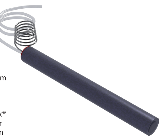
Ebonex® anodes with electrical connectors

Ebonex® is a discrete Impressed Current Cathodic Protection (ICCP) anode, specifically designed to protect reinforced concrete and steel-framed structures from corrosion. The anode utilizes an innovative ceramic/titanium composite, combined with an integral gas venting system. The anode system utilizes Ebofix grout, a high density, acid buffering grout used for long-term performance. Ebonex® discrete anodes are available in a range of sizes to provide excellent design flexibility. Ebonex® discrete anodes are capable of exceeding the 100mV potential shift requirement for effective Cathodic Protection, as defined in NACE (National Association of Corrosion Engineers) standard RP0290 and the European Standard EN12696 - Cathodic Protection of Steel in Concrete.