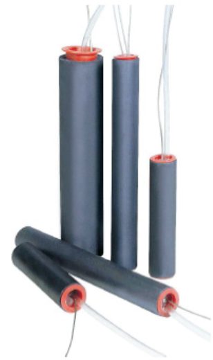
Ebonex® anodes with electrical connectors

Discrete Cathodic Protection Anodes for Reinforced Concrete Structures and Steel Framed Buildings