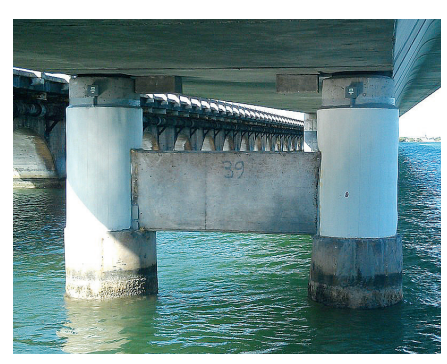
to pile sections above the tidal zone.

system requires little or no maintenance and restores concrete loss due to steel corrosion and concrete spalling in one operation. Galvashield DAS Jackets can be round or square and can be supplied or modified on site to suit project conditions.