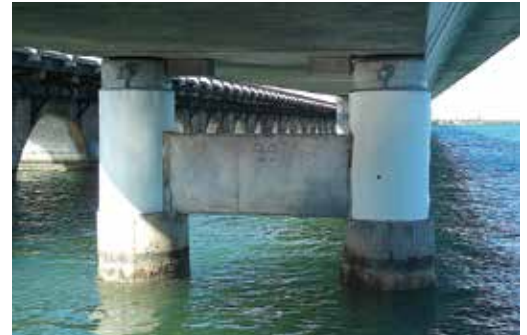
Galvashield DAS Jackets provide protection to pile sections above the tidal zone.

The Galvashield DAS Jacket system with modular formwork is very simple to install and most work can be completed while the structure remains in service. The system requires no maintenance and restores concrete loss due to steel corrosion and concrete spalling in one operation. Galvashield DAS Jackets can be round or square and are supplied in custom lengths suited for the project.