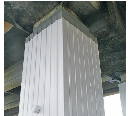
Galvashield Tidal Plus Jacket provides protection to pile sections in the tidal zone and above the splash zone.

The Galvashield Tidal Plus Jacket system with modular formwork is very simple to install, and most work can be completed while the structure remains in service. The system requires no maintenance and restores concrete loss due to steel corrosion and concrete spalling in one operation. Galvashield Tidal Plus Jackets can be round or square and care available in custom lengths which can be modified in the field to suit project conditions.