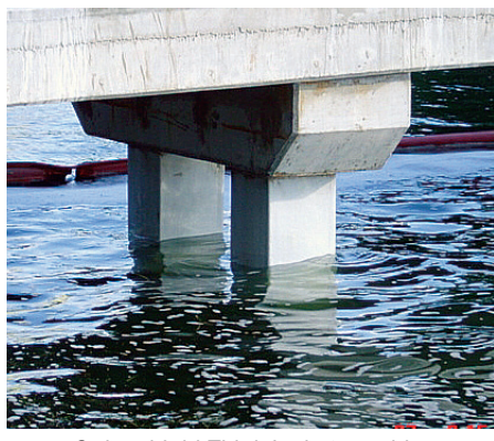
Galvashield Tidal Jacket provides protection to pile section in the tidal zone

The Galvashield Tidal Jacket system is simple to install, and most work can be completed while the structure remains in service. The system requires no maintenance and restores concrete loss due to steel corrosion and concrete spalling in one operation. Galvashield Tidal Jackets can be supplied as round or square jackets with custom lengths suited for the project.