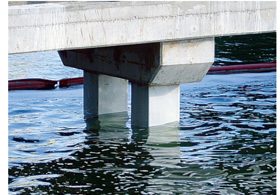
Galvashield Tidal Jacket provides protection to pile section in the tidal zone

The Galvashield Tidal Jacket system is simple to install and most work can be completed while the structure remains in service. The system requires no maintenance and restores concrete loss due to steel corrosion and concrete spalling in one operation. Galvashield Tidal Jackets can be supplied as round or square jackets with custom lengths suited for the project.