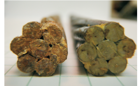
Post-Tech PTI impregnation material mitigates corrosion on post-tension strands (right)

The Post-Tech PTI impregnation process can be completed from the end anchorage or from intermediate locations along the length of the tendon. Experience has shown the Post-Tech PTI material can flow through the interstitial spaces at least 250 ft (75m) along the length of a tendon from a single entry point.