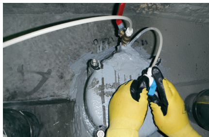
Post-Tech PTI impregnation occurring through the end cap of a post-tension tendon