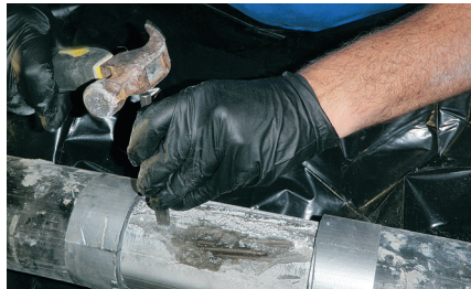
Opening in post-tension tendon verifying presence of Post-Tech PTI material around the strands