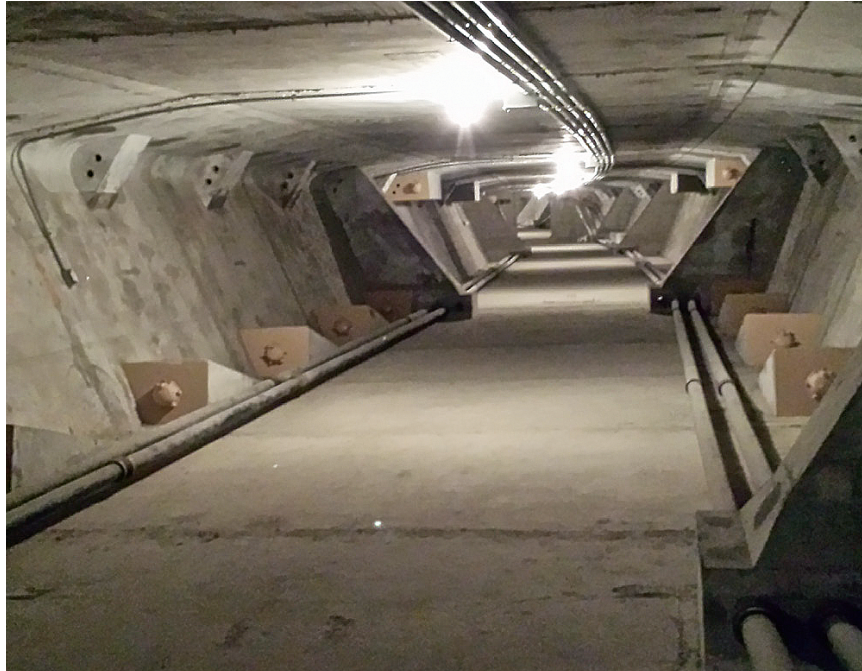
External tendons being impregnated with Post-Tech PTI material