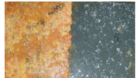
Salt spray testing on steel plate with Post-Tech PTI treated section (right)