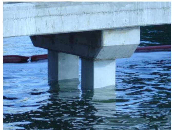
Galvanode Jacket provides protection to piles

* As with all galvanic protection systems, service life is dependent upon a number of factors including reinforcing steel density, concrete conductivity, chloride concentration, humidity and anode mass.