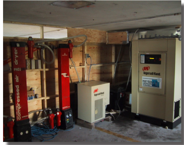
Post-Tech PT Cable Drying Equipment

A permanent cable drying system incorporates a dry gas manufacturing plant, gas distribution lines to all identified cables in a structure, and utilizes control and testing equipment to ensure specified levels of protection. Performance can be monitored manually or by means of electronic sensors installed for remote off-site monitoring and control.