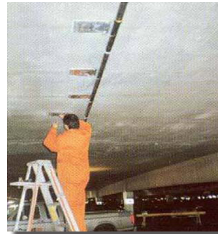
Post-Tech PT Cable Drying Gas Distribution Line