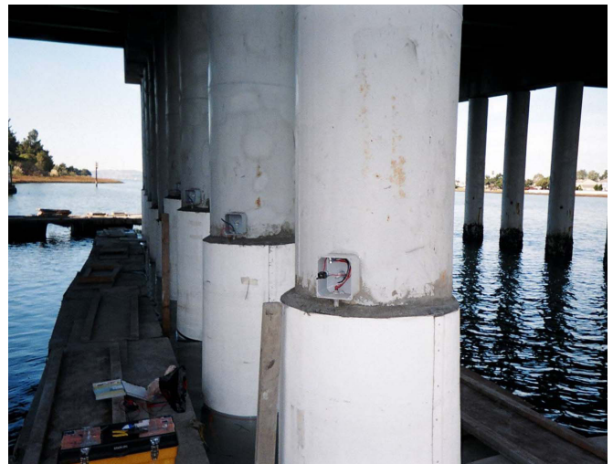
Galvanode DAS Marine Anodes inside stay-in-place FRP Forms