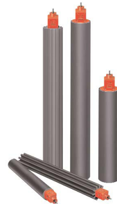
Ebonex anodes with electrical connectors