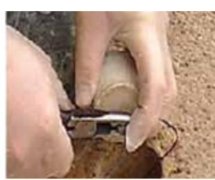
6 Connect anode to header wire