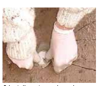
8 Install mortar and anode