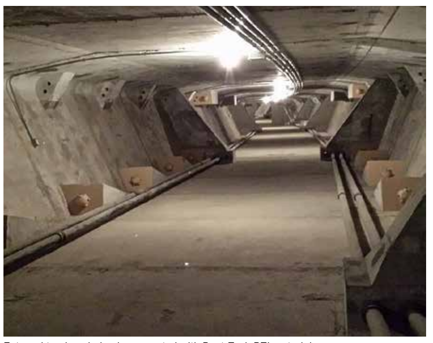
External tendons being impregnated with Post-Tech PTI material