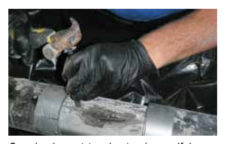
Opening in post-tension tendon verifying presence of Post-Tech PTI material around the strands