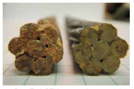
Post-Tech PTI impregnation material mitigates corrosion on post-tension strands (right)

The Post-Tech PTI impregnation process can be completed from the end anchorage or from intermediate locations along the length of the tendon. Experience has shown the Post-Tech PTI material can flow through the interstitial spaces at least 250 ft (75m) along the length of a tendon from a single entry point.