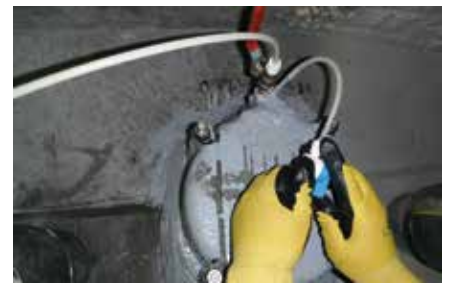
Post-Tech PTI impregnation occuring through the end cap of a post-tension tendon