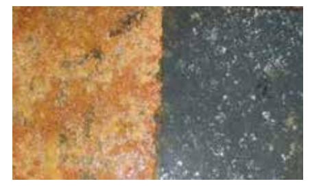
Salt spray testing on steel plate with Post-Tech PTI treated section (right)